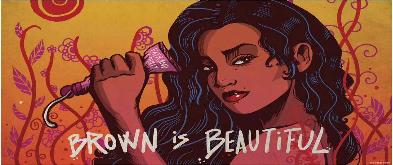
Figure 3: Illustration by Shehzil Malik

https://www.dw.com/en/is-my-shirt-long-enough-artist-shehzil-malik-launches-pakistans-first-feminist-fashion-line/a-42069858