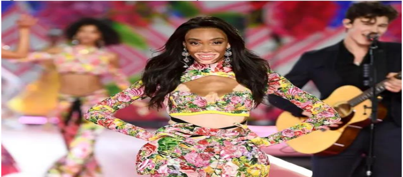
Figure 2: Winnie Harlow walks the runway at the 2019 Victoria's Secret Fashion Show

https://www.businessinsider.com/models-breaking-barriers-in-fashion-industry-2019-1#supermodel-winnie-harlow-was-the-first-model-with-vitiligo-to-walk-in-the-victorias-secret-fashion-show-1