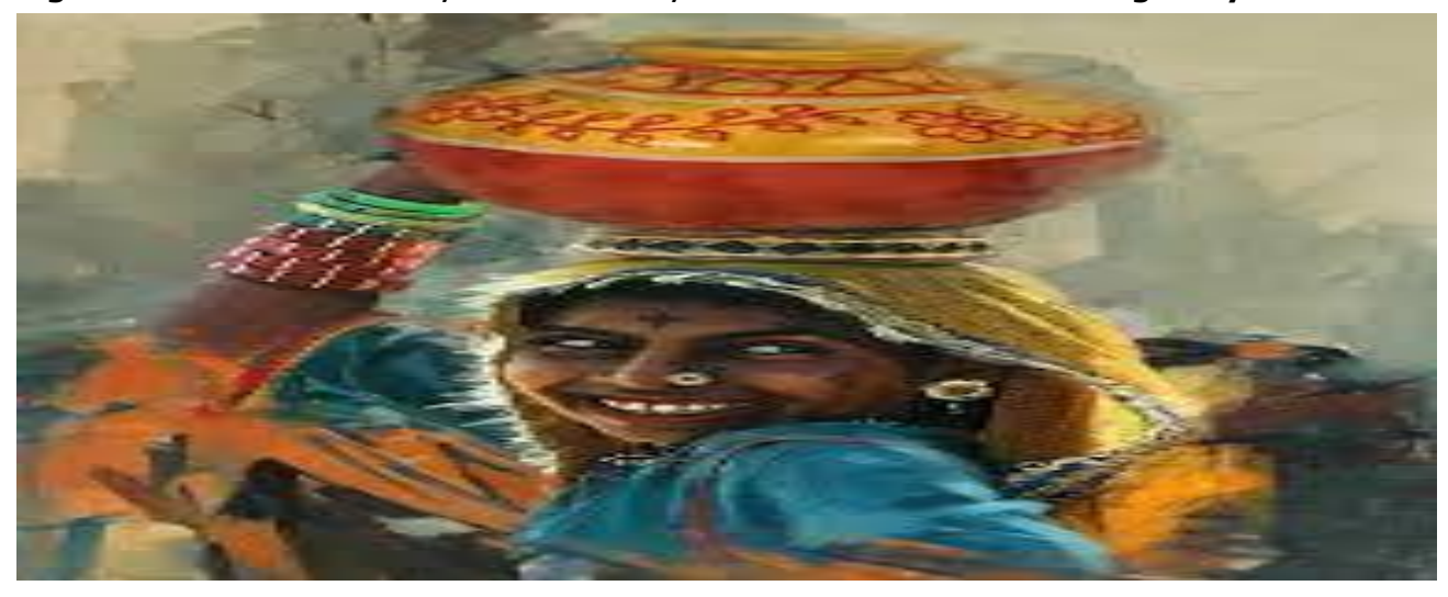
Figure 5, Digital Painting printed on heavy 300gsm paper, unframed. Glossy prints are not individually signed by the artist. Artist Mahnoor Jamal, Size: 8'' \times 5.5'' ,