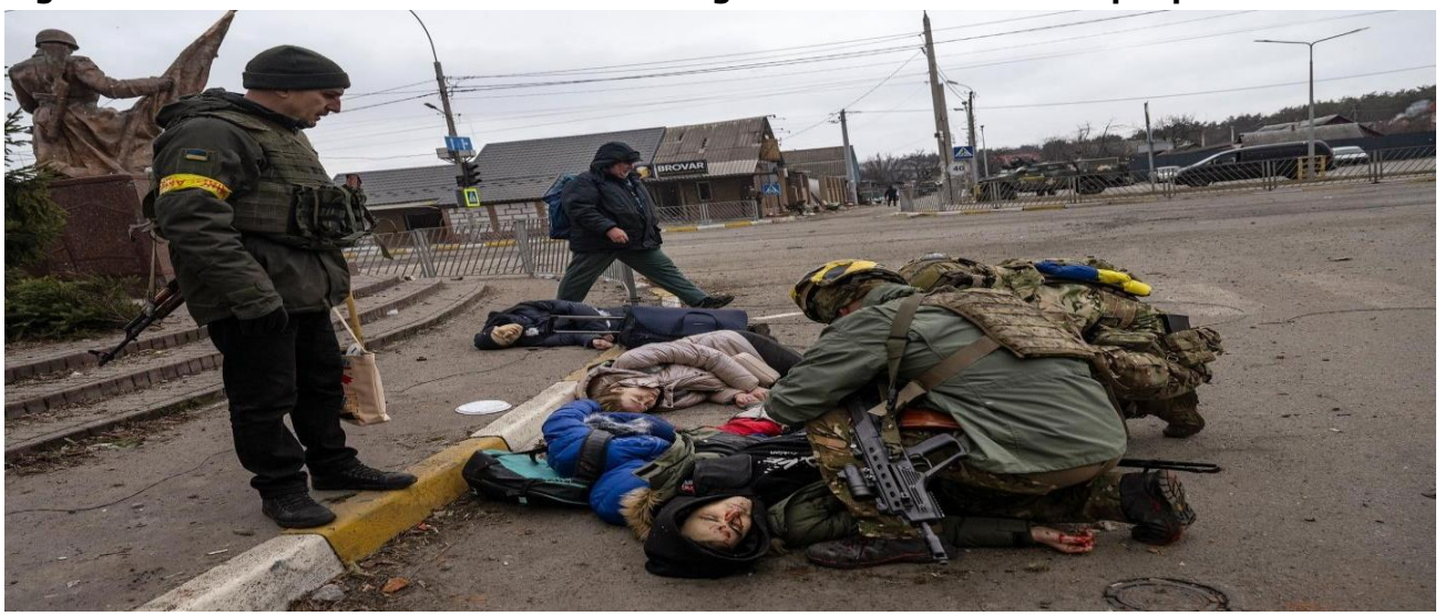
Figure 6: The Ukrainian soldiers are looking at the dead Ukrainian people