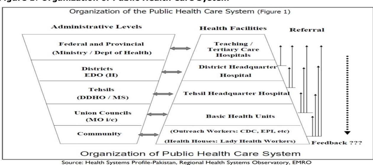
Figure 1: Organization of Public Health Care System

Punjab's services are delivered through a meticulously planned infrastructure. The health department in the province is comprised of 2,461 basic health units (BHUs), 293 rural health centers (RHCs), 88 tehsil headquarters hospitals (THQs), 34 district headquarters hospitals (DHQs), and 23 teaching/tertiary care hospitals. The provided organizational chart effectively illustrates the structure of the public health care system in Punjab, Pakistan. The administrative structure of the Punjab health department exhibits a well-coordinated and strategically designed government and healthcare system, along with its infrastructure.