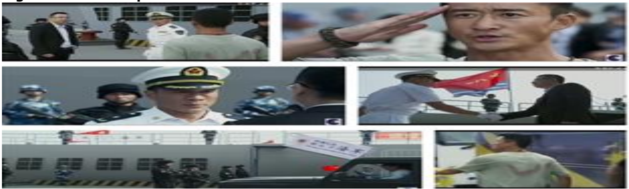
Figure 6: Visual representation of China's Ambassador Arrived

The movie Wolf Warrior 2 depicts how China follows international obligations and proved itself as the safeguard of global security. BRI foreign policy must develop and maintain regional and global security. China is a permanent member of the UN mission of peacekeeping and peace building around the world (Voon & Xu, 2020).