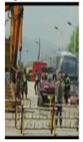
Figure 3: Visual representation of Chin's Embassy and American (nurse)

The Wolf Warrior 2 indicates that China is a more progressive and qualified country as compared to Western countries in the context of protecting human rights overseas. It was illustrated through film the expenses of the US embassy where Leng Feng and Richels (American nurse) wins the thriller victory over the rebels (Zhao, 2013). Therefore, Richel suggested to Leng Feng to get help from the US embassy which was the safest place for the African civilians. After this, she found that the embassy was closed. Subsequently, Leng Feng drives to the Chinese embassy which was open. This representation claims the superiority of China emerged through its contrast as well as the China consulate is more reliable and responsible (Jiang, 2021). Furthermore, the researcher observed the Chinese National flag and repeated announcements by the Chinese identities in the film which make sense support to the Chinese nation and the defined communities.