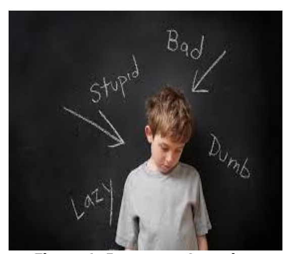
Figure 1: Impact on Learning

It is well established that during the school years these issues have started to incubate. This means that children who stutter cannot and should not participate properly in the classroom. This is how they know and they talk badly of themselves. They worry about themselves.