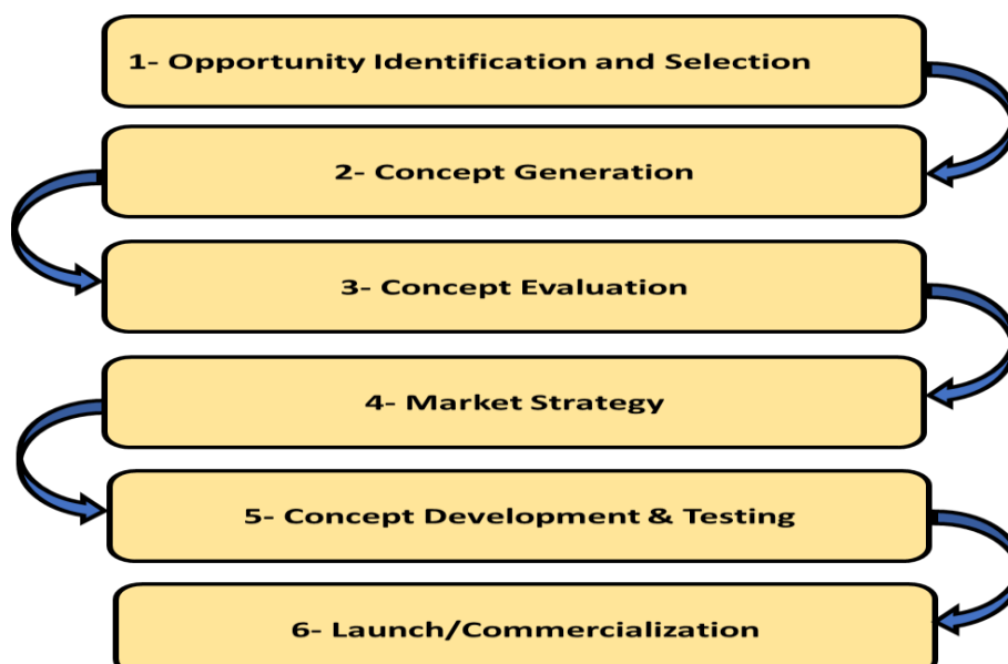
Figure 3: introduction of the Product in the Market

There are main stages involved in introducing a new product into the market, and each phase is important when it comes to the final success of the new product. At every step, a reevaluation is done to establish the point of no return in the process and to determine whether further modification or enhancement is required to achieve product success. Accordingly, each stage is crucial for being successful overall.